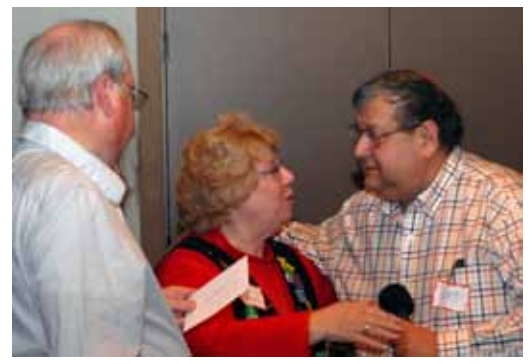
Carnival Recognition Awards