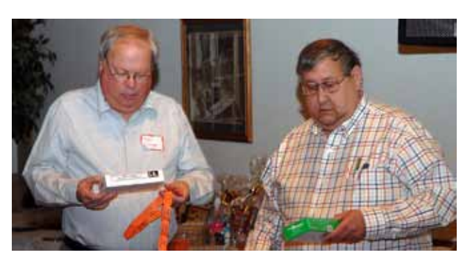
Raffle Winner (one of many)