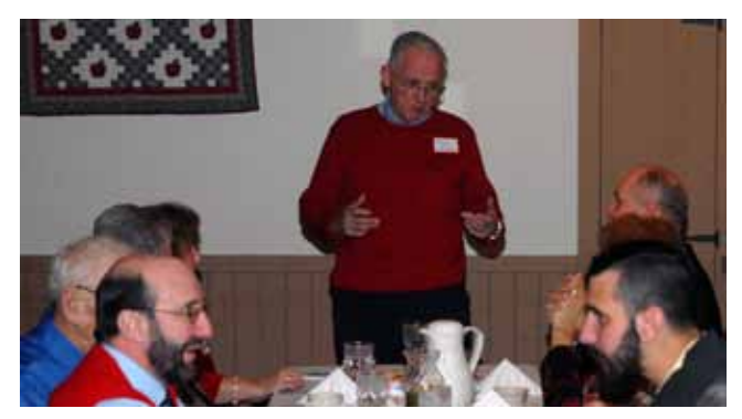
Family and Friends