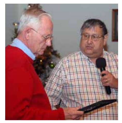
Membership Achievement Award